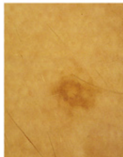
50× magnification of skin (pigmented spot)