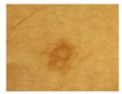
50× magnification of a pigmented spot

With the VL-5, you will be able to explain the state of the customer's skin on the spot, thereby providing reassurance and satisfactory service.