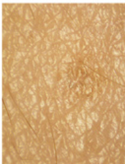
50× magnification of skin (skin texture)