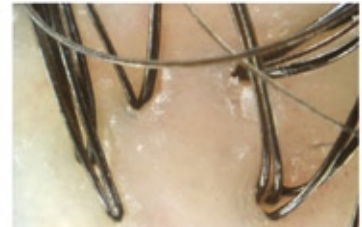
100× magnification of scalp