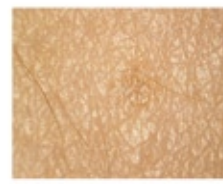
50× magnification of skin texture